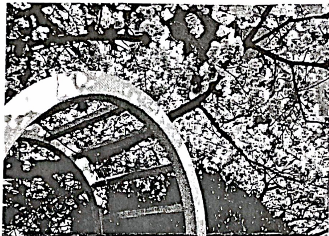
Pear trees in early bloom along Baxter Road